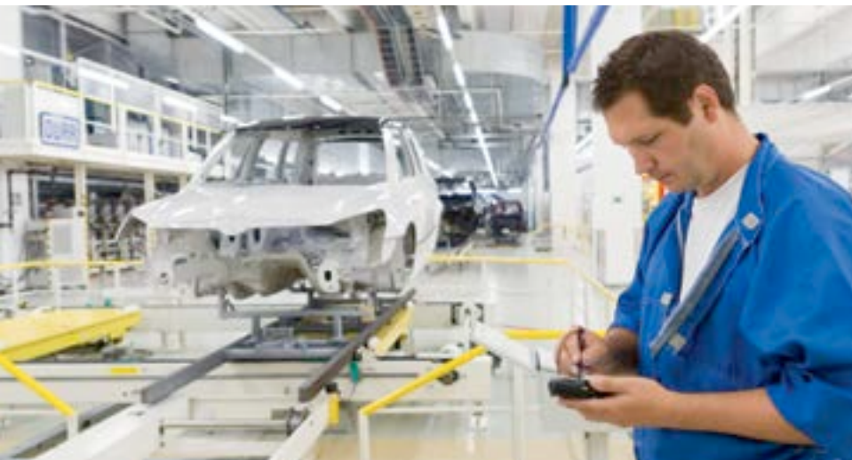
Paint shop – production line