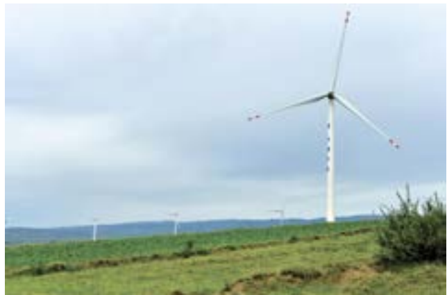
Successful migration: CCWE has converted the main controller of its 1.5 MW wind turbines to an open, PC-based system from Siemens.