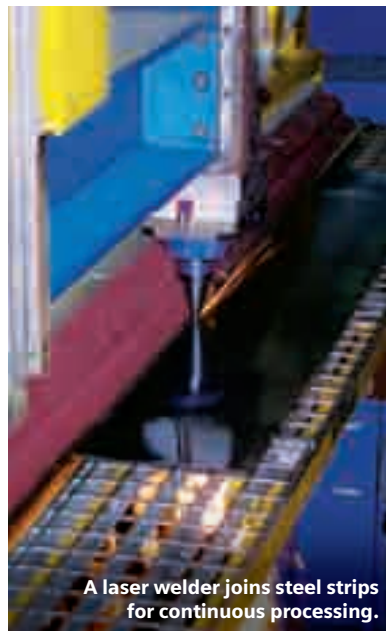
A laser welder joins steel strips for continuous processing.

formance, productivity and cost-efficiency benefits. Better control of over thickness also improves the performance and service life of downstream equipment such as scale breakers, skin-pass mills, etc. The laser's flexibility to cut and weld high-strength and carbon-quality steel in homogeneous as well as heterogeneous combinations imposes fewer constraints on production management. And since there is no contact between the welding head and strip, coated and uncoated strip surfaces can be joined without any cutting and welding-tool wear.