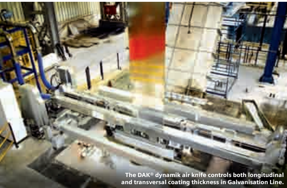
The DAK® dynamik air knife controls both longitudinal and transversal coating thickness in Galvanisation Line.