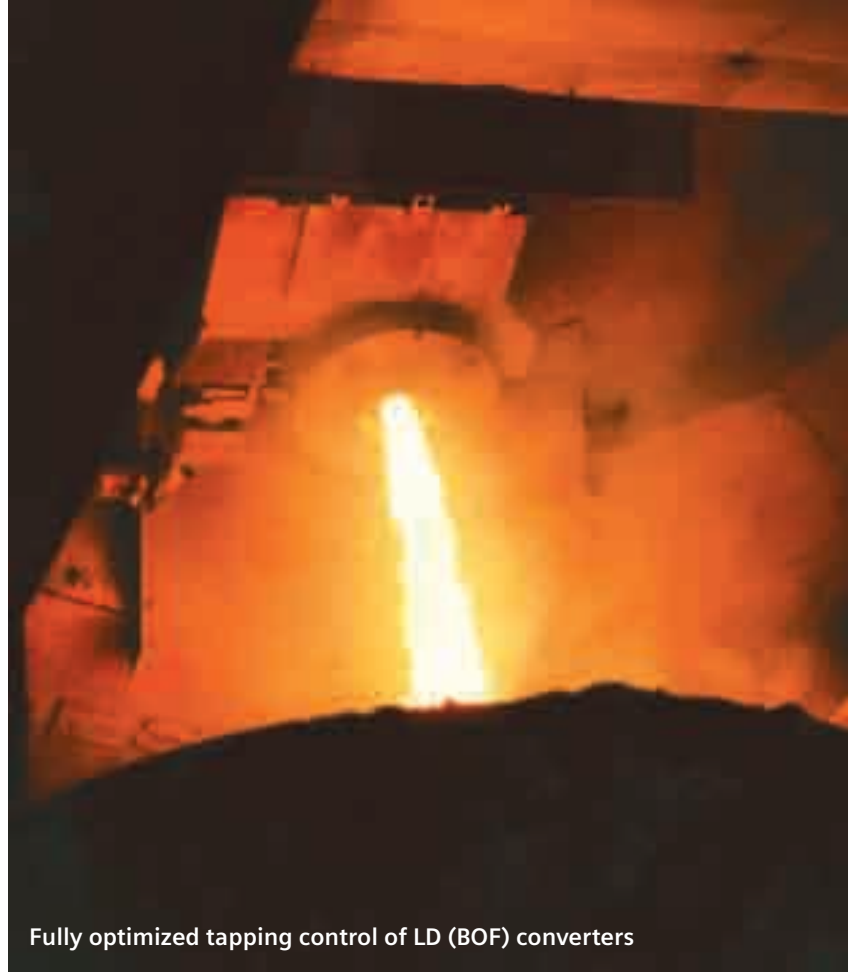
Fully optimized tapping control of LD (BOF) converters

With the automatic tapping system from Siemens VAI, the converter is tilted to the initial tapping angle to start the procedure. The tilting-drive angle is automatically changed by the PLC-based automation system applying three different approaches: The time-based method uses a predetermined start-of-tapping angle and changes the tilting angle as a function of time. If the tapped steel weight is measured by a weighing system on the tapping car, the tilting angle can be automatically changed on the basis of this parameter. These methods do have disadvantages, however, such as the influence of the actual geometry of the tapping hole on the tapping duration and the availability of the weighing system. Siemens VAI is currently investigating a totally new method that will employ a laser-based bath-level detection system (see Figure). The steel bath level is adjusted so that it is