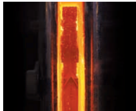
Pushing of coke from a coke-oven battery