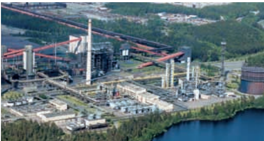
State-of-the-art cokemaking facilities at Rautaruukki Oyj, Finland

The payback time for an automation investment can be estimated by taking into account the cost savings from reduced external energy requirements, increased