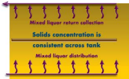
Solids concentration-with jets