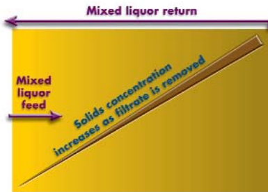
Solids concentration-without jets