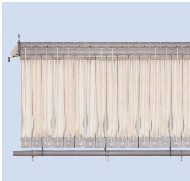
B30R Membrane Rack with Integral Air/Filtrate Header

Our Petro™ MBR process achieves these benefits by allowing the biological processes to be operated at elevated mixed liquor concentrations by providing positive liquid/solids separation through ultrafiltration membranes. Careful management of the membrane environment is designed into our systems to prevent solids buildup and dehydration on aerated membrane surfaces, and to provide continuous fluid transfer at the membrane surface, which is critical for stable long-term membrane operation.