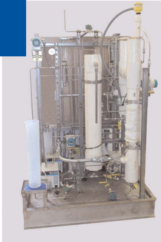
Petro™ MBR pilot unit