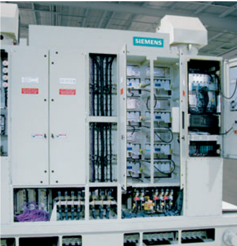
One common skid holds all IGBT power and control components.