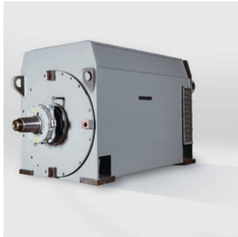
Mining-duty Hoist motor with speed sensor